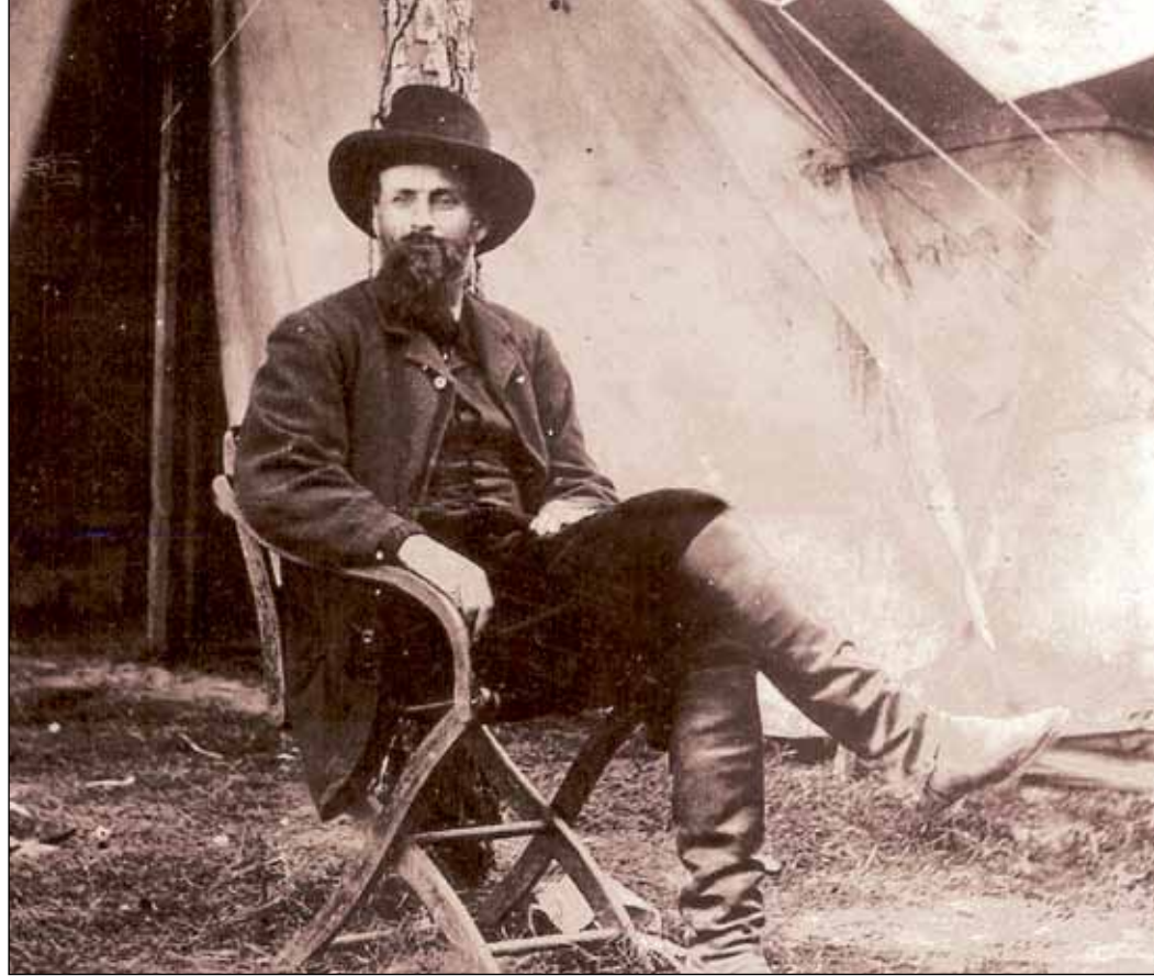
Charles A. Dana: Dana, a friend of Karl Marx, Fredrick Engels and Joseph Weydemeyer, rose to the level of assistant secretary of war in Lincoln's administration. Lincoln spoke of Dana as "the eyes of the Army." No other nineteenth century individual did more to promote communism in America than Dana.

Lincoln also stated the Union created the states. Is there evidence to prove the states existed before the Union? Here, according to James Kent of New York, are the basic functions of a sovereign state: (1) Conducts war or pursues peace, (2) Makes laws to regulate society, (3) Taxes and spends tax