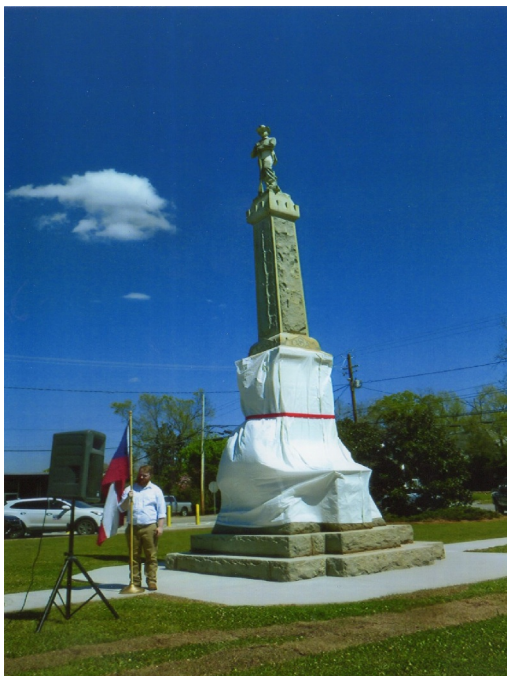
The First National Flag was placed at the Confederate Soldier monument for the re-dedication ceremony on March 30, 2019.