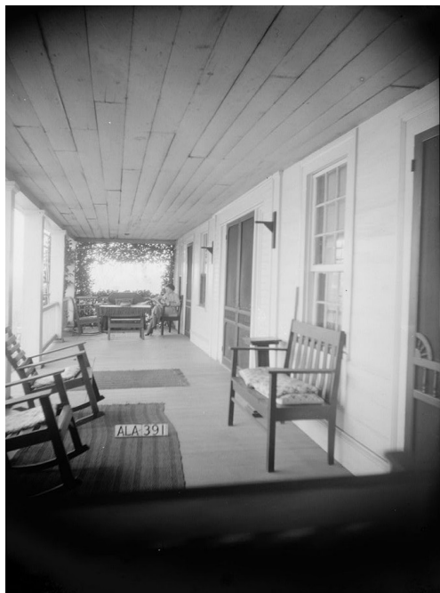
James Greer Bankhead House U.S. Route 278, Sulligent Lamar County, AL 1936 Front Porch