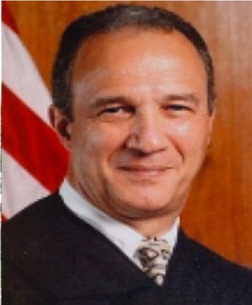
Jefferson County Circuit Judge Michael Graffeo

Judge rules Alabama Confederate monument law is void; city of Birmingham didn't break the law