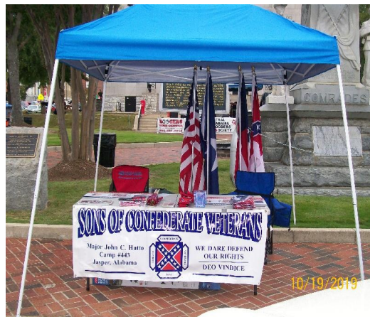
Recruiting booth at the Jasper Car Show on Saturday, 19 October 2019