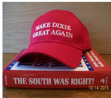
Hat & Book available at scv.org