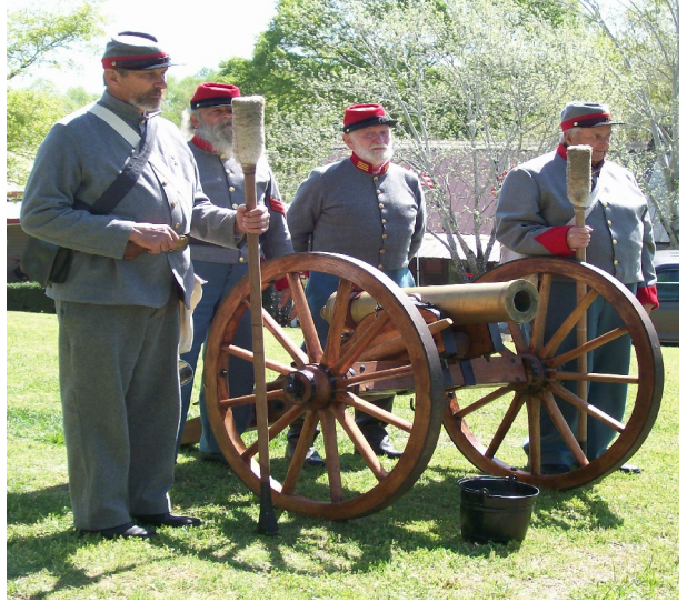
Cannon Crew St. Clair Camp #308 Crooked Creek Museum 20 April 2013