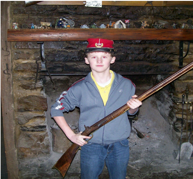
Hutto Camp Cadet Muster Crooked Creek Museum 20 April 2013