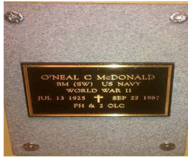
BRONZE NICHE (Z)

This niche marker is 8-1/2 inches long, 5-1/2 inches wide, with 7/16 inch rise. Weight is approximately 3 pounds; mounting bolts and washers are furnished with the marker. Used for columbarium or mausoleum interment. Also provided to supplement a privately-purchased headstone or marker for eligible Veterans who died on or after November 1, 1990 and are buried in a private cemetery.