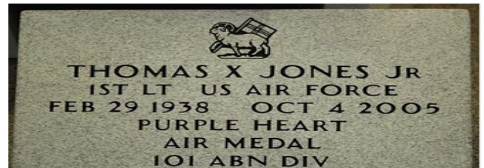
SMALL FLAT GRANITE (L)

This grave marker is 18 inches long, 12 inches wide, and 3 inches thick. Weight is approximately 70 pounds. Variations may occur in stone color.